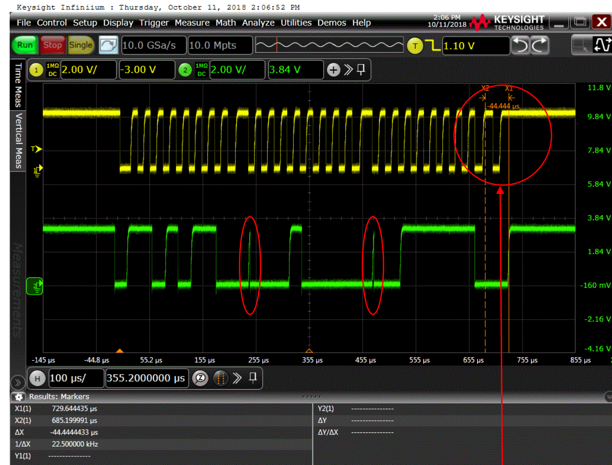
I2Cm Write with I2Cm_SendStop()

I2Cm_fSendStart( TX_address, I2Cm_WRITE ); I2Cm_fWrite( 0x10 ); I2Cm_fWrite( Laser_Buffer_Write[0] );